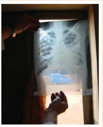
Viewing an x-ray in Madagascar