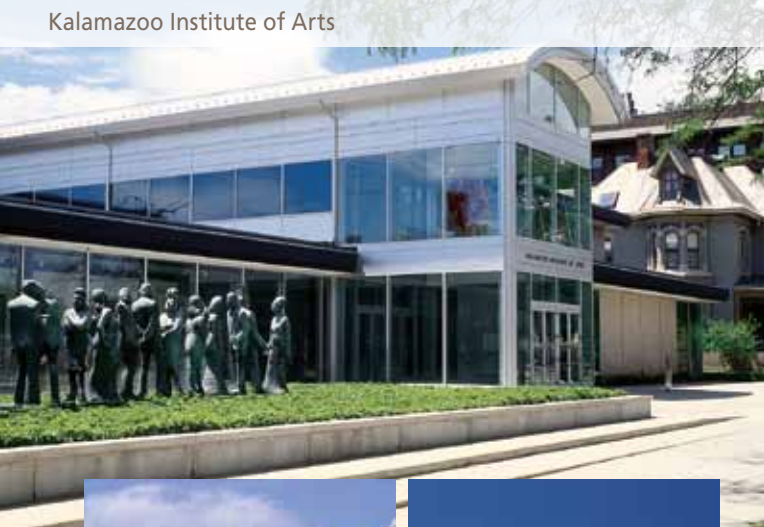
Kalamazoo Institute of Arts

Located halfway between Chicago and Detroit, Kalamazoo is an important destination for business, education and cultural events. Kalamazoo provides all the amenities of a big city only minutes away from the peace and tranquility of the countryside. The maximum commute time anywhere in the city is 20 minutes—no need to fight the traffic related to big-city driving.