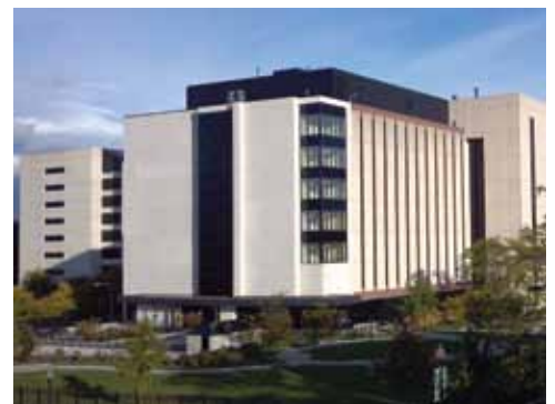
The WMed W.E. Upjohn Campus, scheduled to open Summer 2014