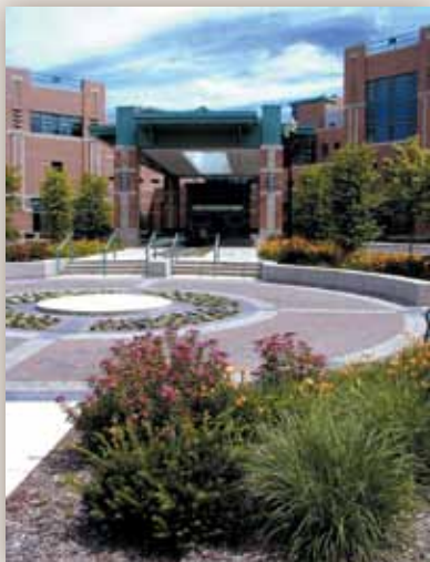
Bronson Methodist Hospital

At the Western Michigan University School of Medicine (WMed), you will have the opportunity to teach medical students and receive clinical instructor status. In addition, Michigan State University College of Osteopathic Medicine sponsors our osteopathic traditional internship and our Family Medicine and Internal Medicine residency programs. WMed is a partnership of Western Michigan University, Borgess Health, and Bronson Healthcare. You will learn in two hospital settings nationally recognized for exceptional quality of care. In the last few years, Borgess and Bronson have received no less than 100 awards and recognition for quality initiatives, including the Malcolm Baldrige National Quality Award, Magnet Hospital for Nursing Excellence designation, and the American Hospital Association McKesson Quest for Quality Prize. The proven commitment to quality standards translates into a level of residency training experience that rivals major university medical centers while providing the advantage of a community-based patient population.