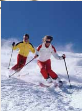
Kalamazoo Nature Center