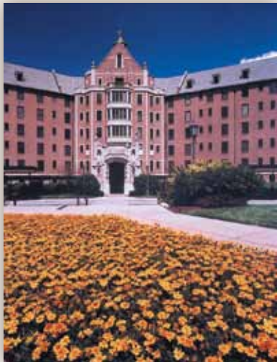
Borgess Medical Center

WMED IS A UNIQUE UNIVERSITY-COMMUNITY INTEGRATED PROGRAM.