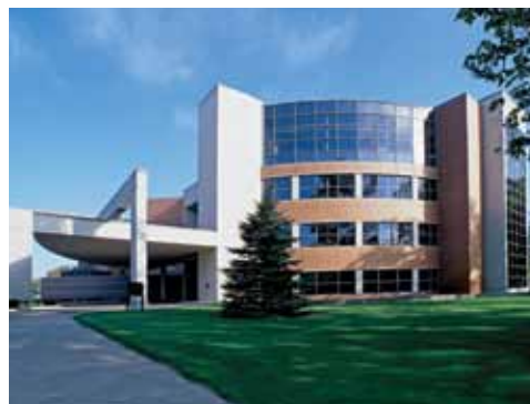
The WMed Oakland Drive campus

Our residents are encouraged to participate in many research opportunities. In recent years, our Research Day has featured a Nobel Prize-winning speaker and each year brings increased participation in our oral and poster presentations. Our research activity increases each year; we believe research establishes a foundation for quality care and enables us to share medical information that helps transform the lives of many.