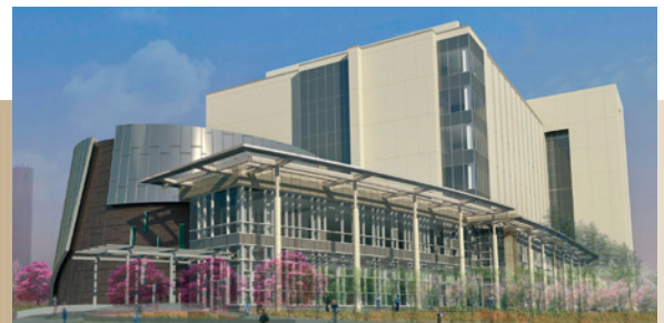
W.E. Upjohn Campus, scheduled to open June 2014