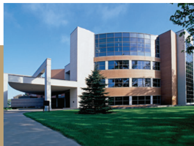
Oakland Drive Campus

Our residents are encouraged to participate in many research opportunities. In recent years, our Research Day has featured speakers from the Institute of Medicine (IOM) and each year brings increased participation in our oral and poster presentations. We believe research establishes a foundation for quality care and enables us to share medical information that helps transform the lives of many.