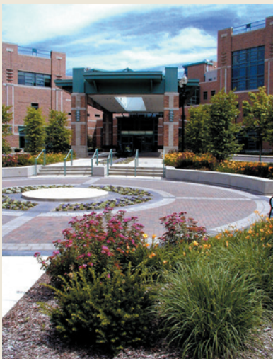
Bronson Methodist Hospital

At Western Michigan University School of Medicine (WMed), you will have the opportunity to teach medical students and receive clinical instructor status. In addition, Michigan State University College of Osteopathic Medicine sponsors our osteopathic traditional internship and our Family Medicine and Internal Medicine residency programs. WMed is a collaboration of Western Michigan University, Borgess Health, and Bronson Healthcare. You will learn in two hospital settings nationally recognized for exceptional quality of care. In the last few years, Borgess and Bronson have received no less than 100 awards and recognition for quality initiatives, including the Malcolm Baldrige National Quality Award, American Stroke Association Primary Stroke Center designation, and the American Hospital Association McKesson Quest for Quality Prize. The proven commitment to quality standards translates into a level of residency training experience that rivals major university medical centers while providing the advantage of a community-based patient population.