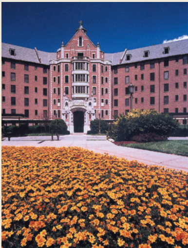
Borgess Medical Center

Our vision is for the medical school to be distinguished as learner centered, discovery driven, globally engaged, and patient and family focused.